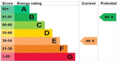
The graph shows this property's current and potential energy rating.